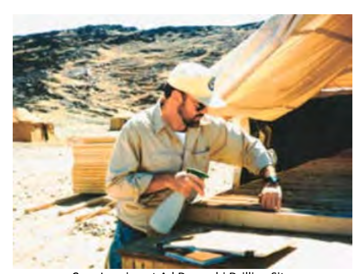
Core Logging at Ad Duwayhi Drilling Site

Gold shows no significant correlation with other metals, except Lead (Pb) and moderate correlation with Silver (Ag).